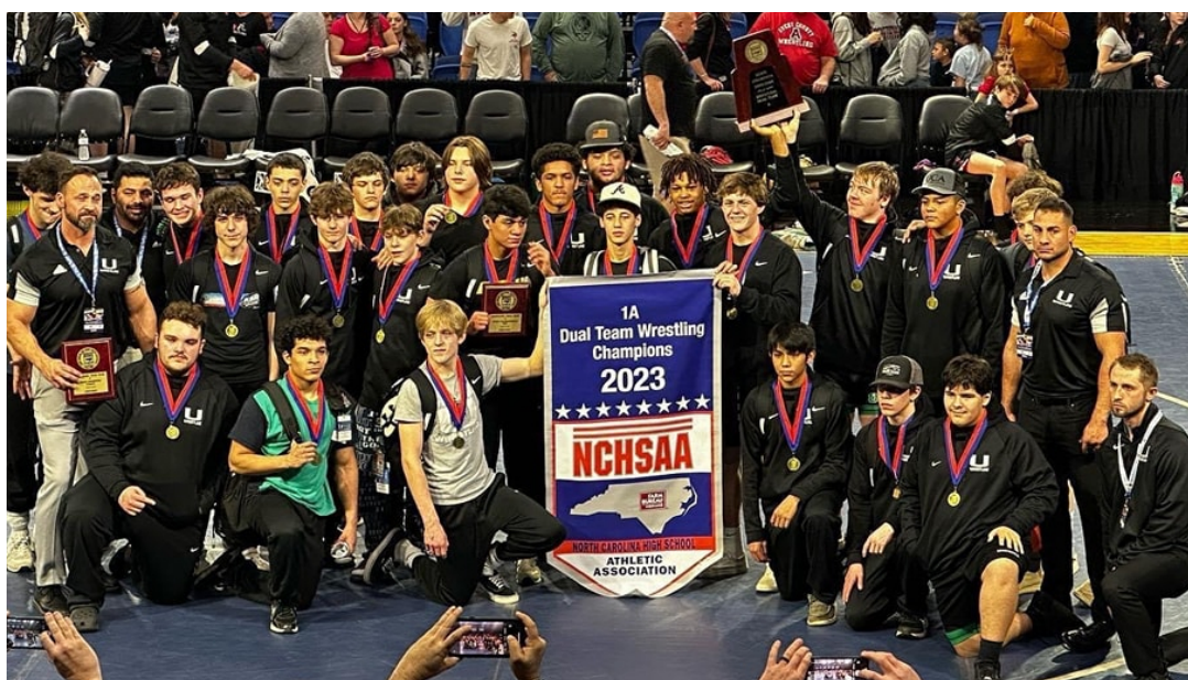
1A Dual Team Wrestling Champion Eagles.