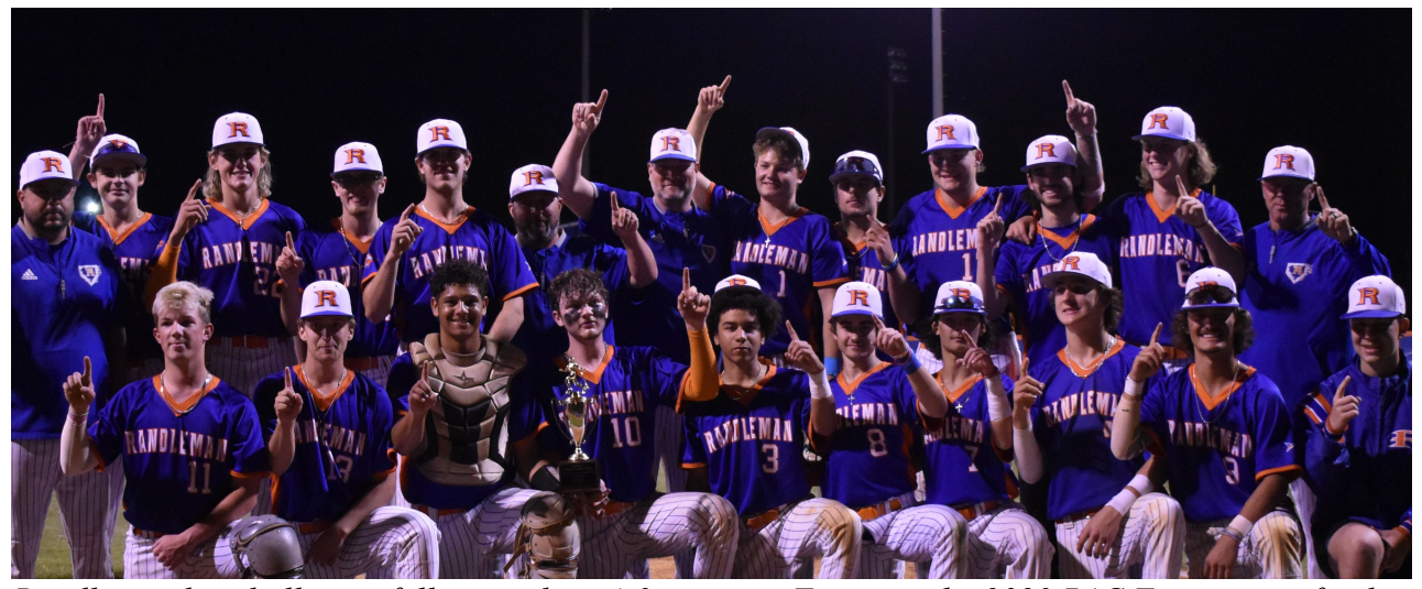
Randleman baseball team following their 4-0 win pver Trinity in the 2023 PAC Tournament finals.

The excitement he and his team displayed after the game showed the Tigers are ready to make a strong run for a third consecutive state championship.