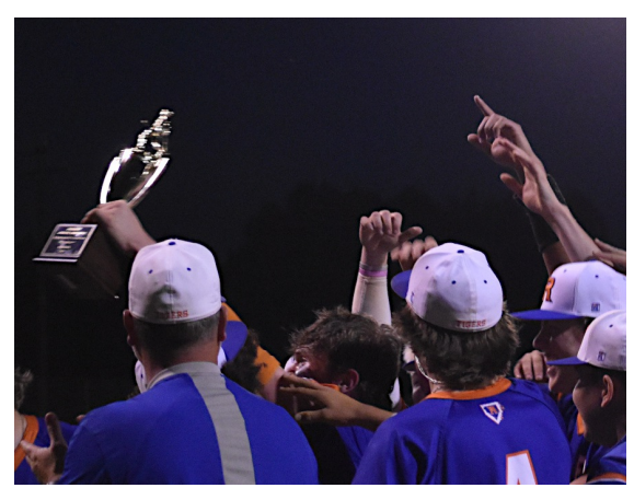
Tigers celebrating a PAC Tournament Championship, May 4, 2023.

With the Tigers being tested throughout the conference season and then once again in this year's tournament, the championships may have been a bit sweeter than some of the previous titles.